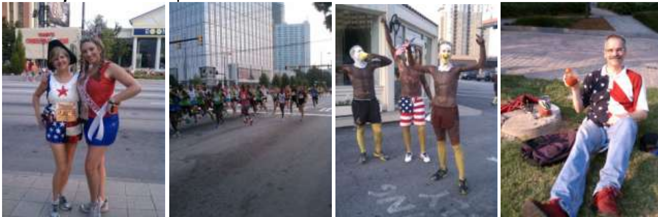
Miss Firecracker. The start that we could both see from our hotel window. Mr. V-8.