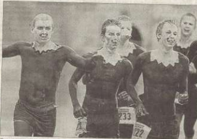
Runners painted as eagles warm up for the 42nd AJC Peachtree Road Race at Lenox Square. Many runners wore costumes or body paint.