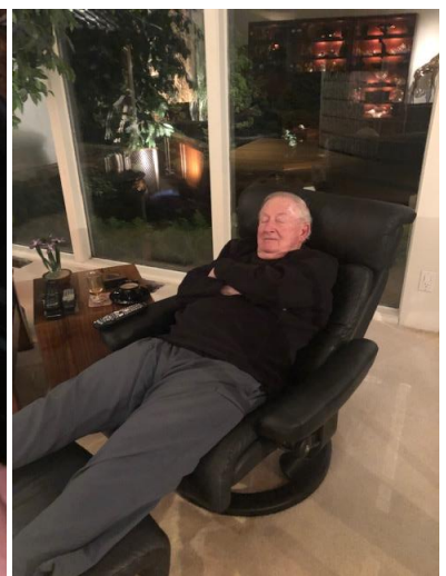
The dinner was enjoyed at least a couple nights. (There were actually two dinners, two days apart!) It was a big day for the 85 th Birthday, well enjoyed and well tuckered out.