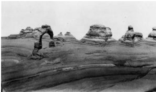
Arches National Park, early 1930s to mid-40s