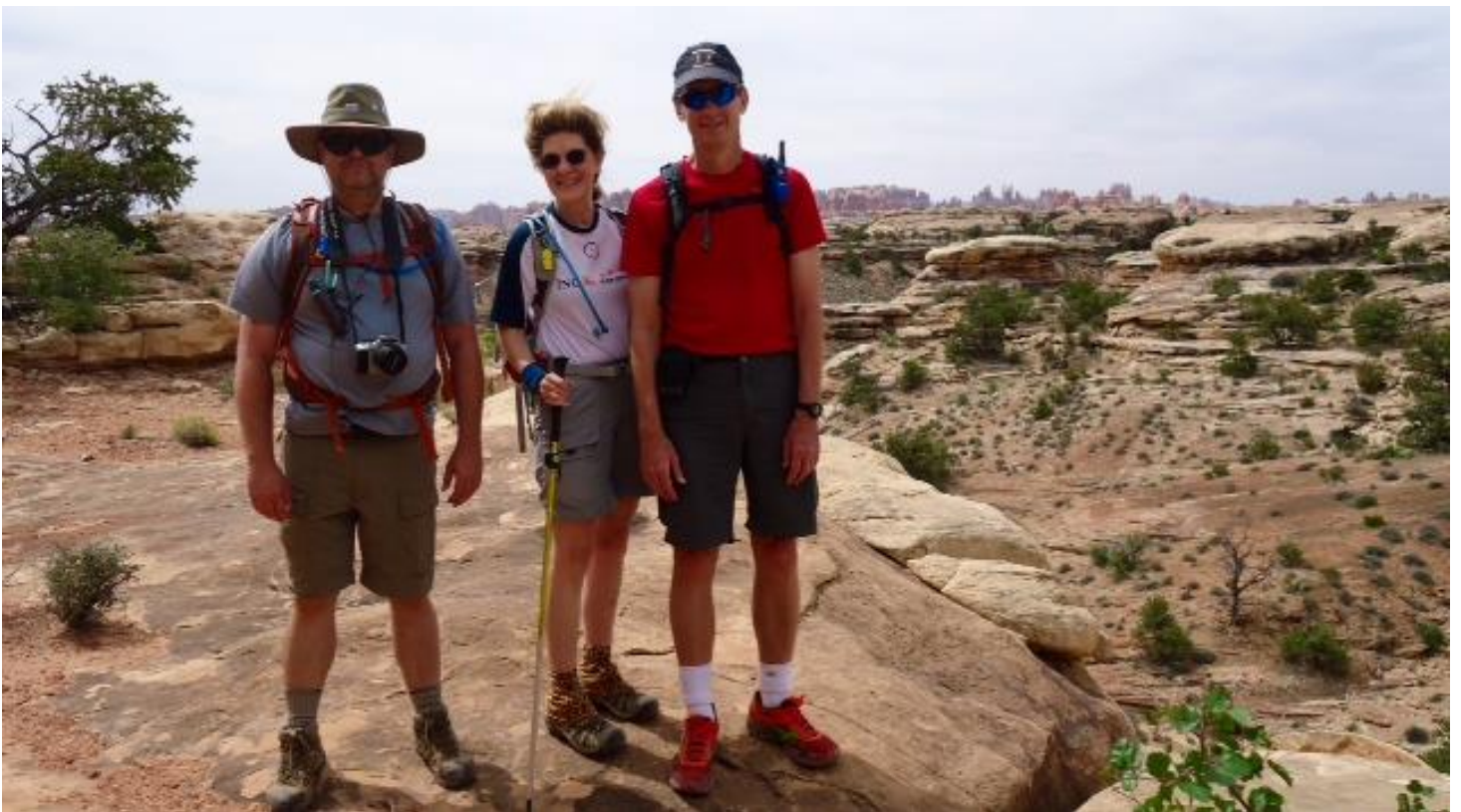
A very windy Canyonlands and another day of scrambling. Superwoman got deflated.