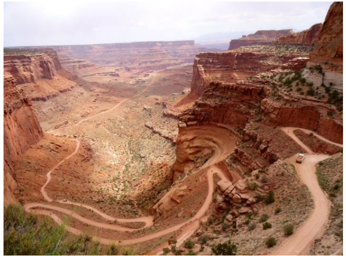
White Rim from Grandview Trail; Schaefer Trail with a tiny looking but huge dump truck on the trail.