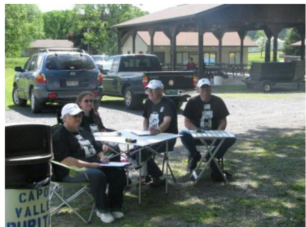
Here's the finish line.