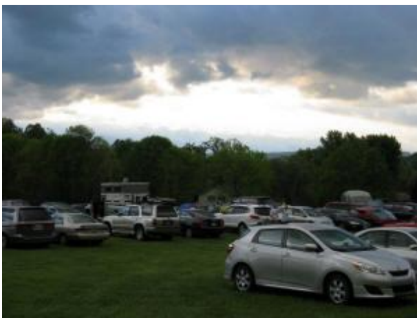
Rain showers at the start which quickly cleared.