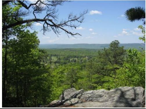
Pictures of two of the guest houses, the music pavilion, the Wednesday and Sunday night dinner location high up on the golf course, the spring fed natural swimming pool, and a view of the golf course from high up White Cliffs trail.