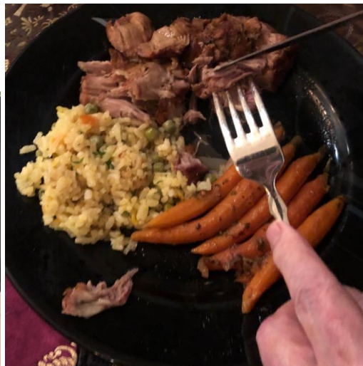
The dinner was enjoyed at least a couple nights. (There were actually two dinners prepared by Ouida, two days apart!) Sorry to not have a picture of the big tiramisu complete with candles. It was a big day for the 85 th Birthday.