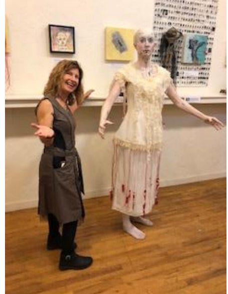
One of the attractions to this downtown Colorado Springs second art show was the “living doll” shown here with the artist. It’s all even better with the free wine and snacks.