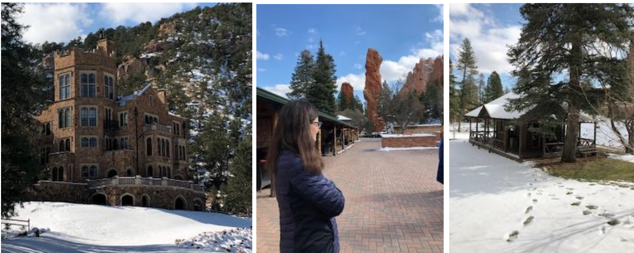
Glen Eyrie, the carriage house complex, and the school house at Glen Eyrie.

And we didn't miss a taco! More tacos on the way.