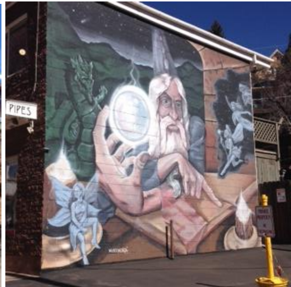
A Mansion we'd toured previously in Manitou Springs, then a side of a building painting of what we were certain was the liquor store manager.