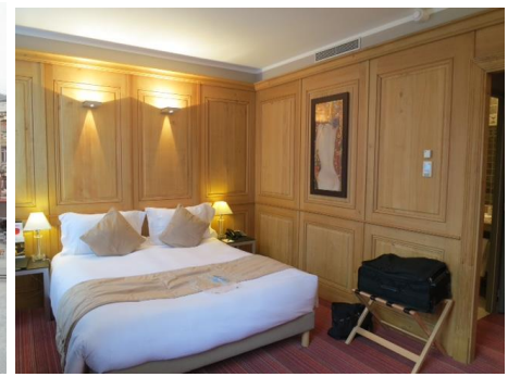
The hotel in Rouen city center, our view from our room, and the room with a portion of a Klimt picture I'd recently read about.