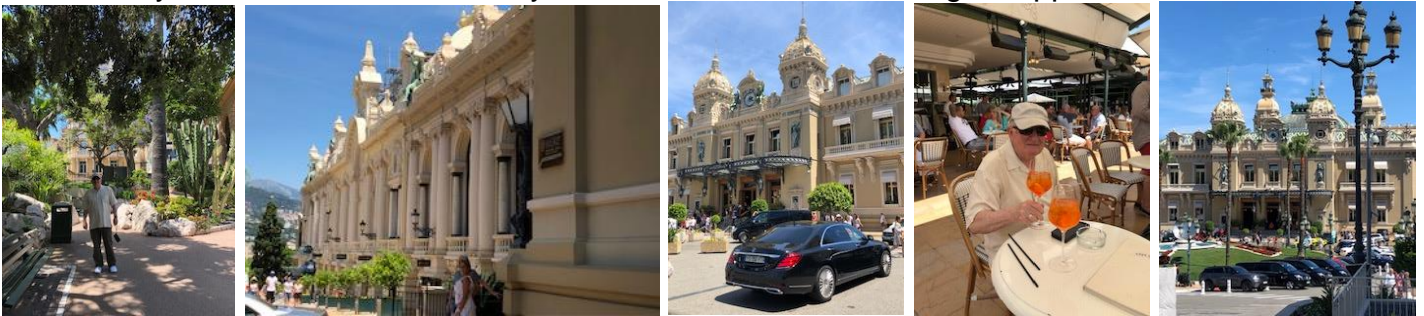
In the Gardens of Monte Carlo facing the casino.

The predicted heat was just beginning but with a bit of breeze and staying in the shade we just managed to survive. But how will we do in a couple days when it is 104°? To be seen. Wednesday we leave the Riviera to Lyon where the record heat might happen.