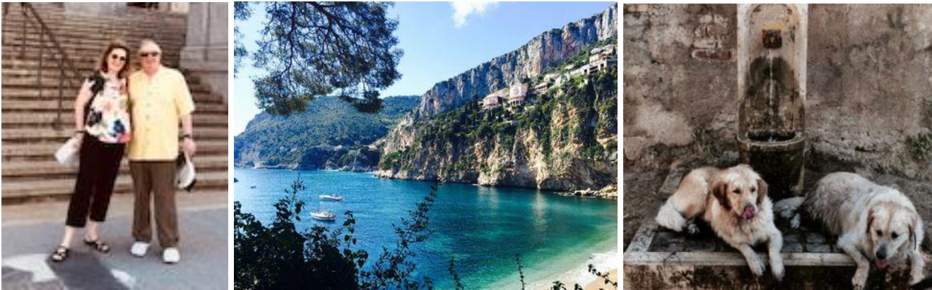
We were just two old dogs trying to survive the heat!