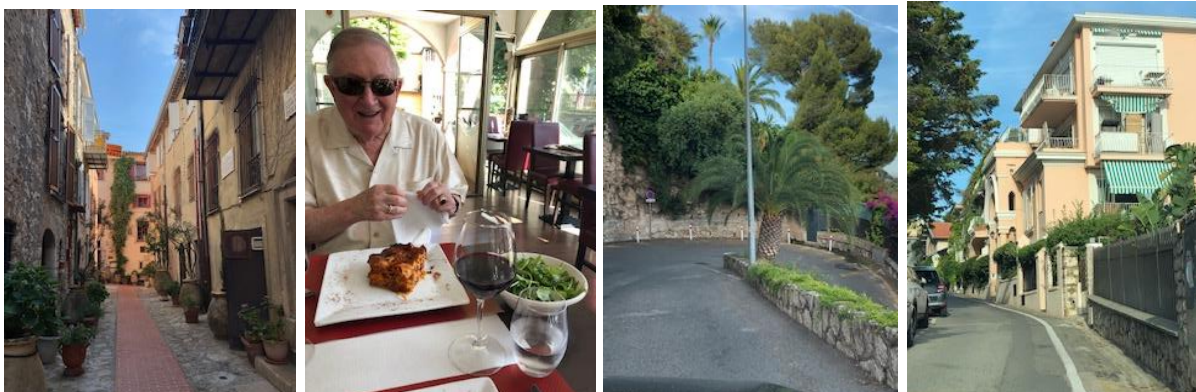
There are many Sweet Streets in La Turbie. Way up high in the mountains.