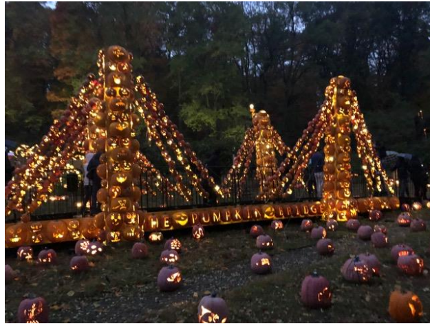
The huge windmill was all pumpkins too, as was the bridge we walked over.