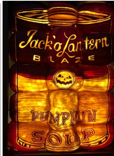
Another section was called the Art Museum with most of the creations being obvious: Frida Kahlo, The Scream, and Andy Warhol.