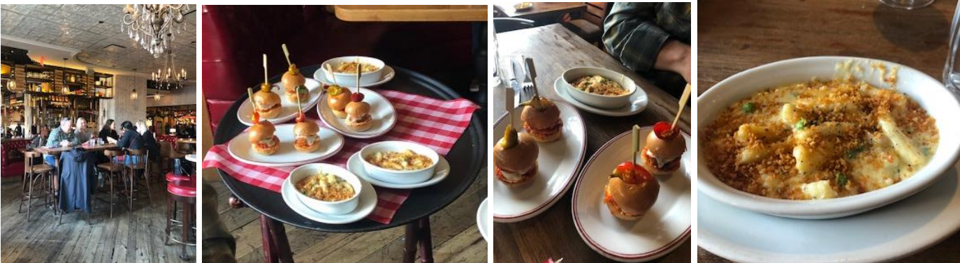
Buddy Vs is in the Venetian. The meatball sliders went into a zip bag for a meal another day. The macaroni and cheese probably was the highlight of the day, yet that was tough to decide.