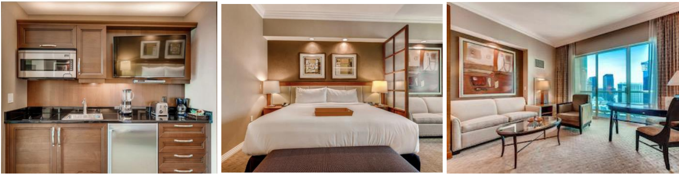
The bathroom(s) included a huge walk in shower, double sinks, separate WC and a giant jacuzzi.