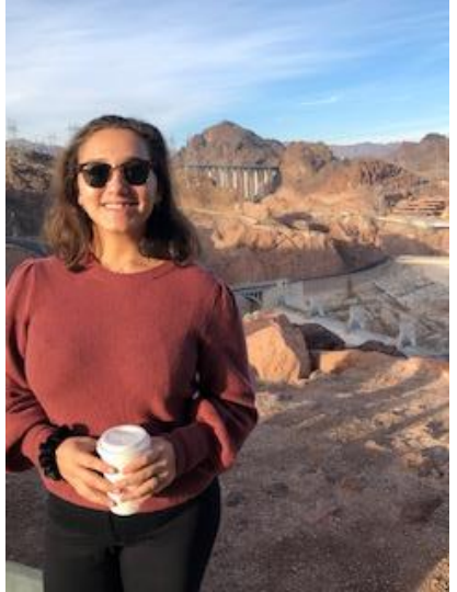
On our way to the Grand Canyon, stopping at an overlook of Hoover Dam.