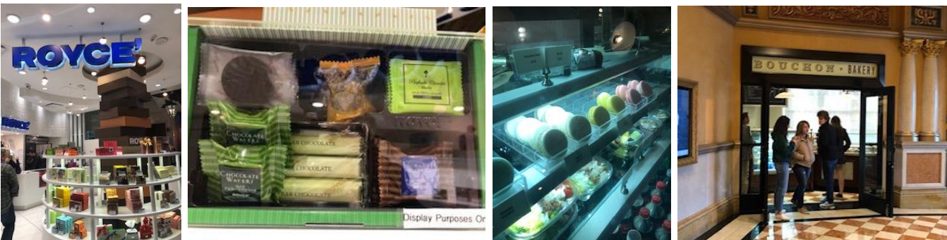
Japanese chocolates that must be eaten in 24 hours? That's what we used to get in Brussels. A box with apparently some preservatives was purchased for a friend of Marie's before sauntering (or