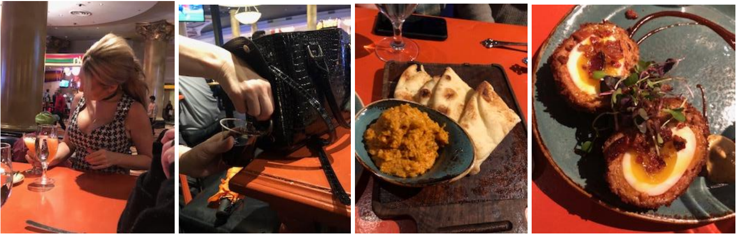
The purse was in reality a wine cooler, pulled out at various stops. Las Vegas allows drinking on the streets. But that wasn't the only entertainment and I was almost surprised to see the casinos continue dressing the waitress staff in Hooters type outfits. Yet, if you've got it, flaunt it?