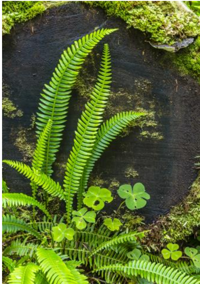
Ferns and sorrel leaves against old stump, Canon EOS 5D Mark III, 24-105mm @ 65mm, f8, 2.5 sec, ISO 800, 2/3, warming polarizer.

As for photography, the beach is the easier location to work with. The background is relatively clean and the centers of interest are easily defined. The redwood forest is another story. Finding beautiful subjects is no problem, but isolating them against a messy background can require a lot of experimentation with different camera angles. Many times the answer was narrowing our focus, zeroing in on what attracted the photographer to the scene in the first place. It's not always easy, but the challenge is part of the fun. Both the redwoods and the beach are incredible playgrounds for someone with a camera, and, like most playgrounds, we had a tough time rounding the kids up when it was time to go.