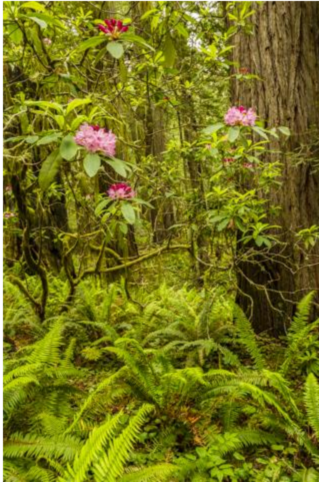
Rhododendron flowers in a redwood grove, Canon EOS 1D Mark IV, 16-35mm @ 22mm, f16, 1/4 sec, ISO 400, -1/3.

This also where wildlife may play a role in your compositions. Sea stars and sea anemones not only make interesting subjects for macro images and intimate landscapes, they also add color and texture to scenic photos. And this year we also had larger animal species to play with. Harbor seals, some with babies, were particularly tolerant this year, a good few of them swimming to our side of a shallow pool to check us out. Now seals lying on the beach are pretty static subjects, although we did have mothers and babies interacting. The movement of the surf however, is a constantly changing picture element, a bit of action in a static image, and a slow shutter speed emphasized this motion nicely.