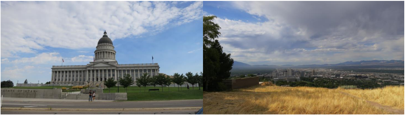
Rob would take us up to a high hilltop to get an overview of a very well laid out and huge city.