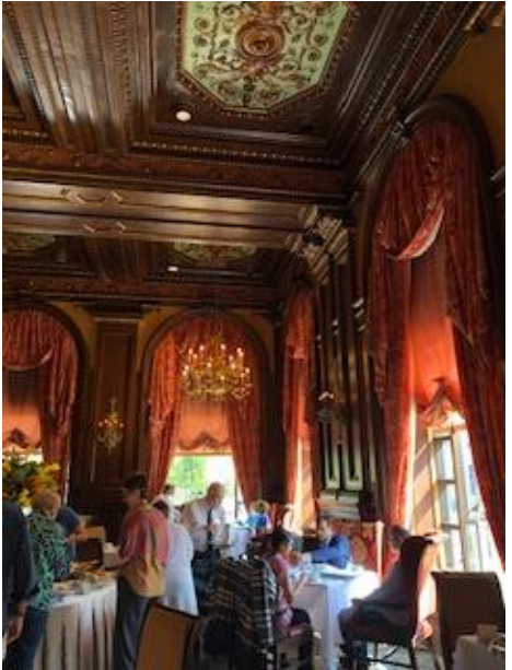
The Lobby, Ceilings and Old Furnishings; then into the Green Room Restaurant for live music (Piano), an appetizer bar that was sufficient for a meal, followed by a choice from the menu, then the dessert bar, all topped off with a mimosa – or two.