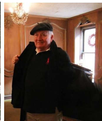
Pictures taken in NYC at the Metropolitan Museum of Art and the historical Barbetta Restaurant.